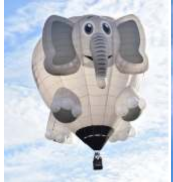
UK - ELII

Mini Balloon Models: Hands-on experiences for