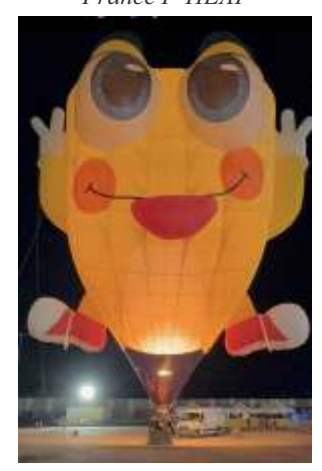
Brazil - Baby Monster

meticulously planned and executed based on the prevailing weather conditions.